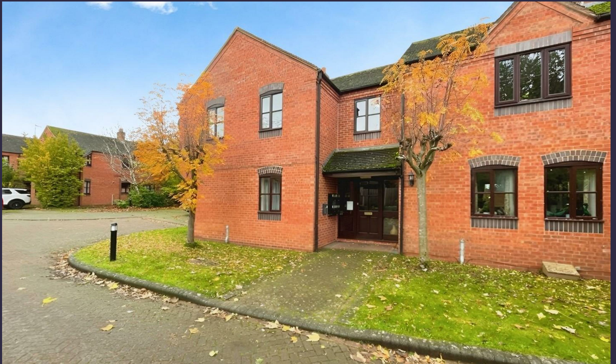
7 Bryan Mews, Bidford-on-Avon, Alcester, B50 4BF