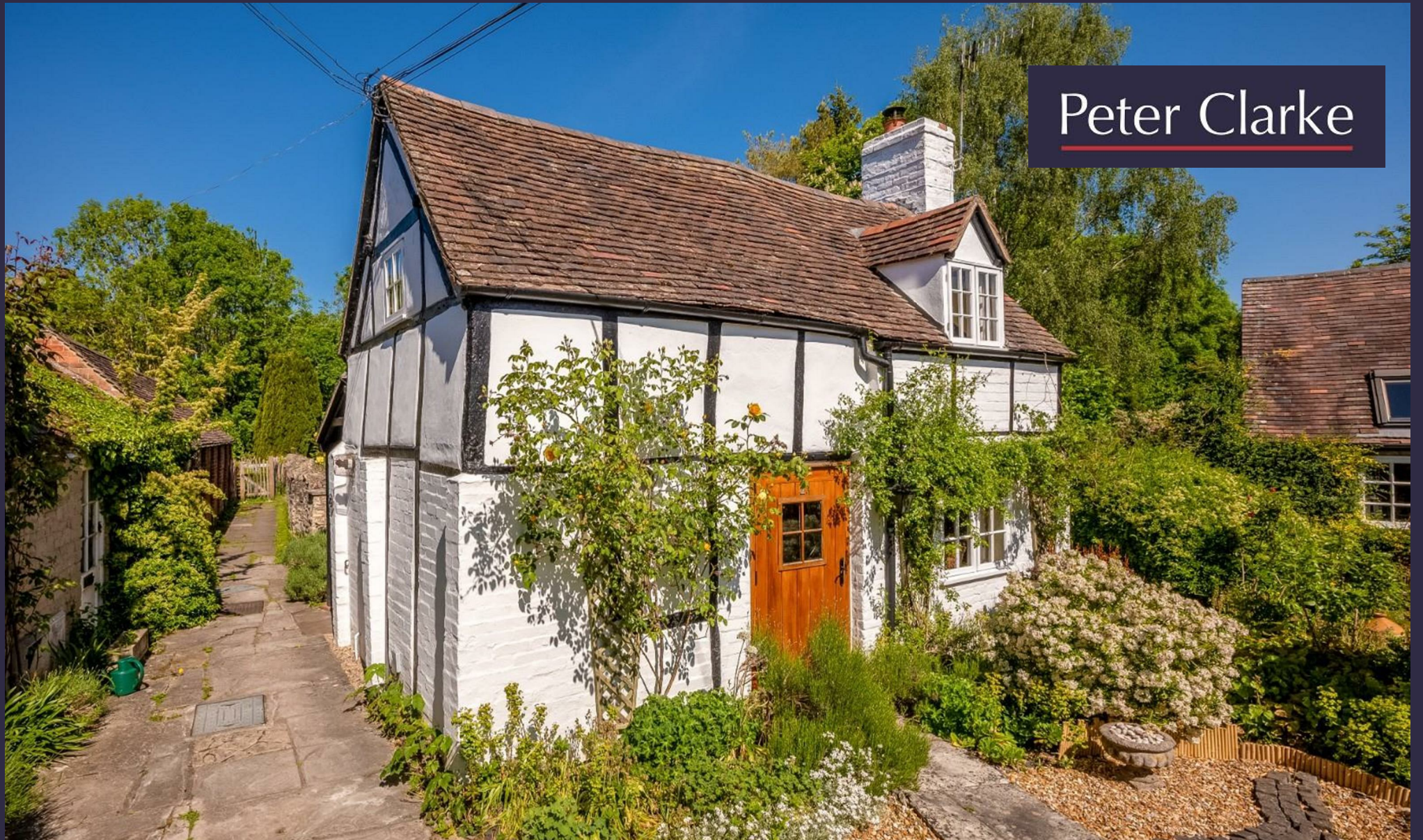
Lantern Cottage, 2 The Hamlet, Marlcliff, Alcester, B50 4NT