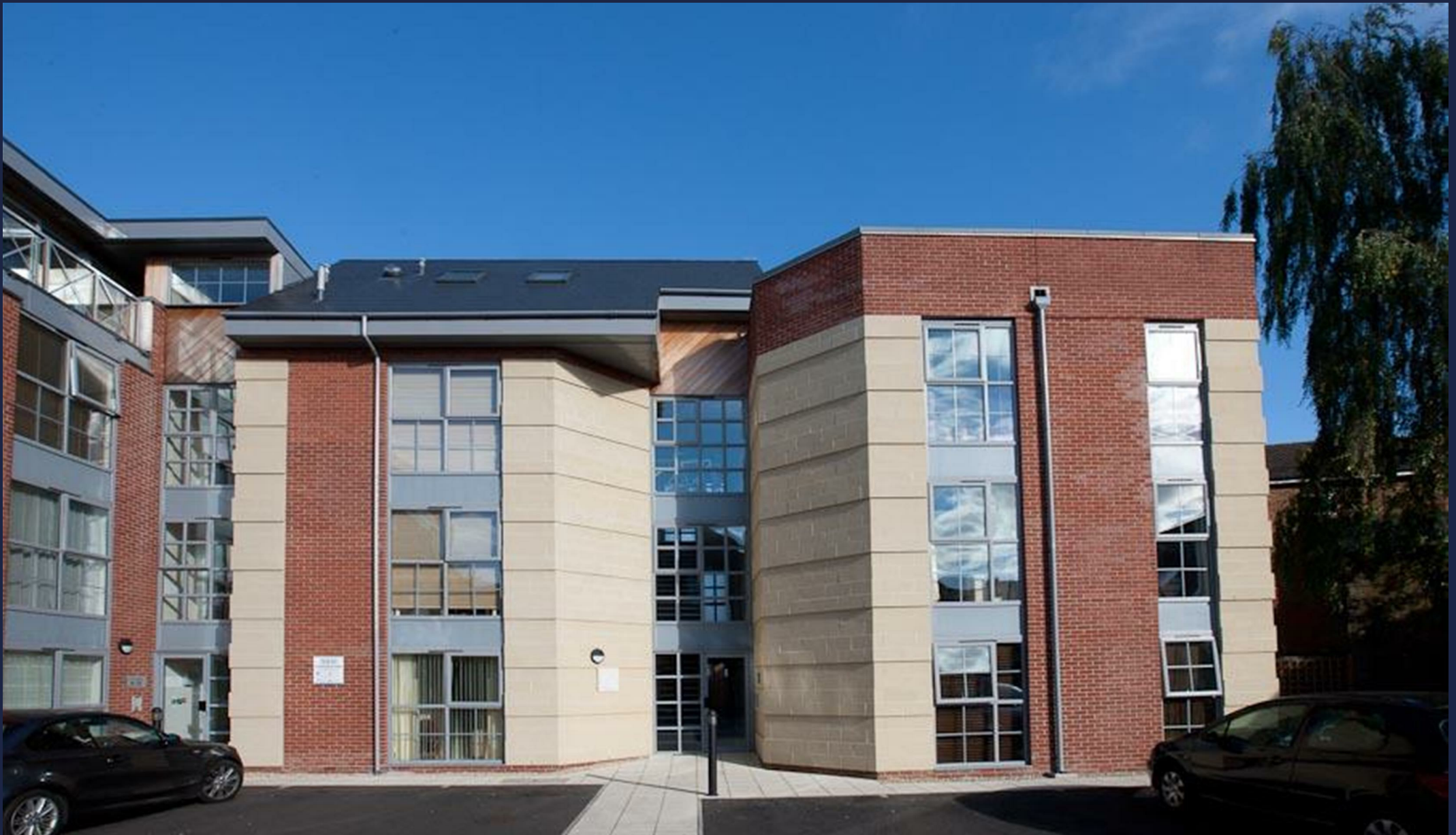
15 Centros Apartments, Fisherton Street, Salisbury