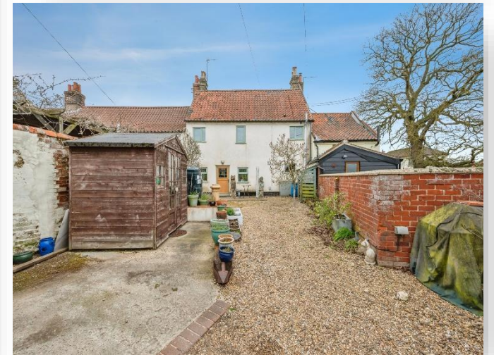
The Cottage, The Street, Swafield, North Walsham NR28 0RJ