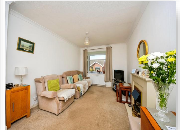
Thorns Drive, Greasby Wirral CH49 3PU