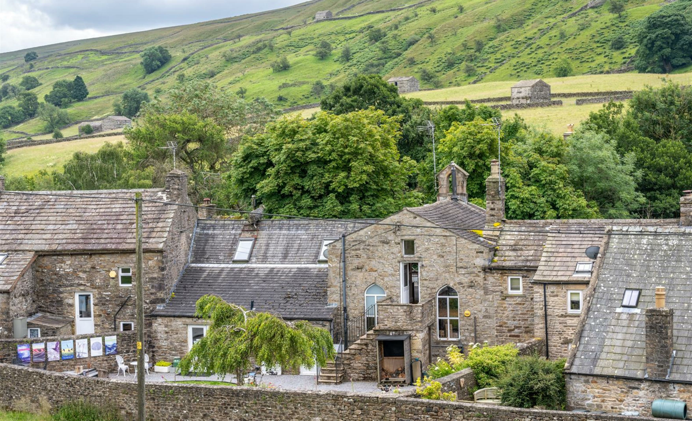
Old School Art Gallery & Craft Centre, Muker, Swaledale, DL11 6QG