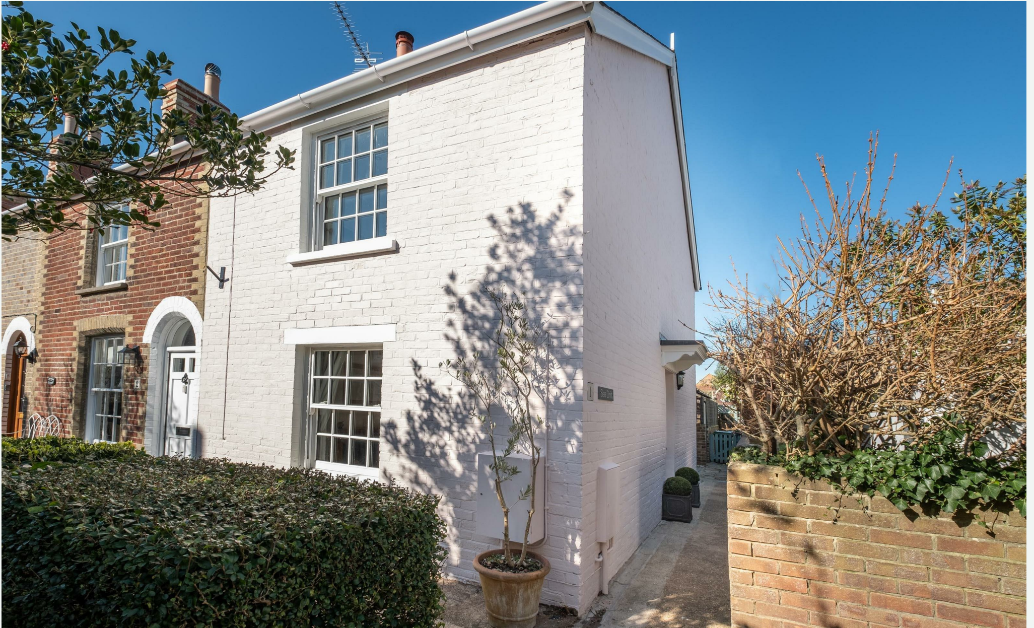
Sea Drift, 1 Alma Place, Yarmouth, Isle of Wight