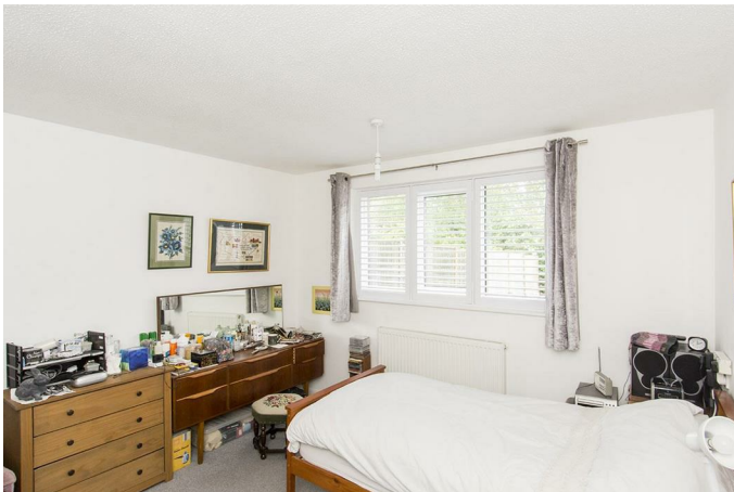
UPVC double-glazed window to rear with plantation shutter. Radiator.