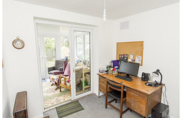
UPVC double-glazed French doors leading through to conservatory.