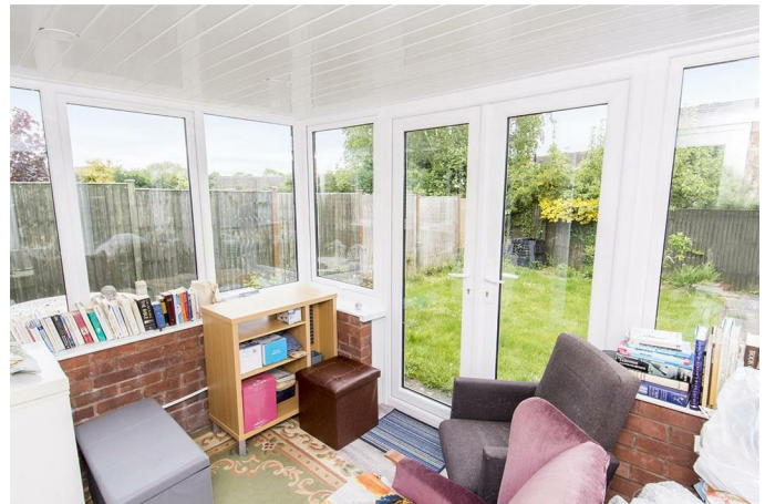
Brick base with UPVC double-glazed windows and French doors leading out to the garden.