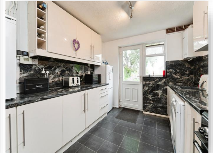
Victoria Street, Littleport CB6 1LU