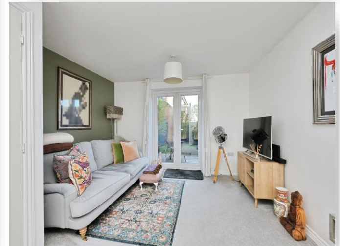
Sunderland Close, Carbrooke Thetford IP25 6GR