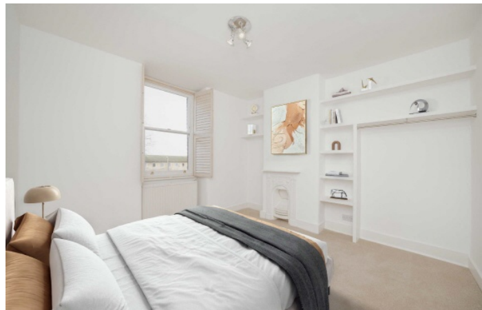
Colney Hatch Lane, N10