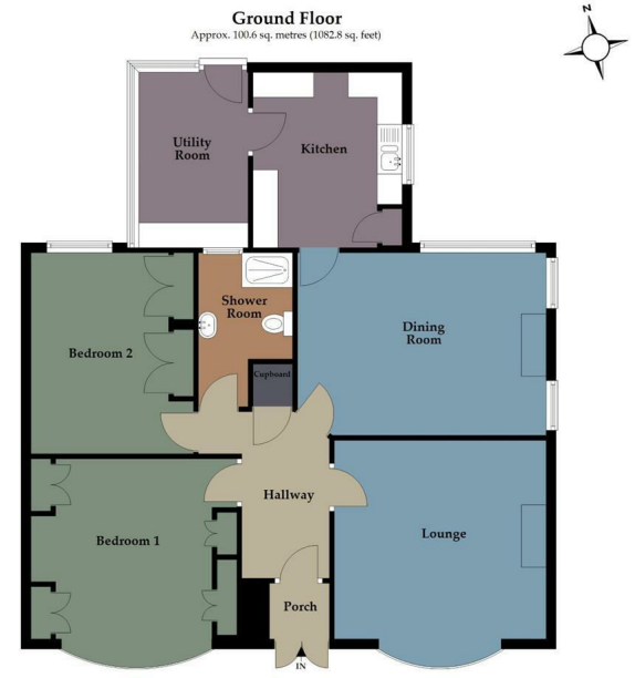
Total area: approx. 100.6 sq. metres (1082.8 sq. feet)

Astleys use all reasonable endeavours to supply accurate property information in line with the consumer protection from unfair trading regulations 2008. These property details do not constitute any part of the offer or contract and all measurements are approximate. The matters in these particulars should be independently verified by prospective purchasers and it should not be assumed this property has all the necessary building regulations and planning permissions. Any heating, services and appliances have not been checked or tested. Floor plan is not to scale and is for illustrative purposes only. Plan produced using PlanIt.