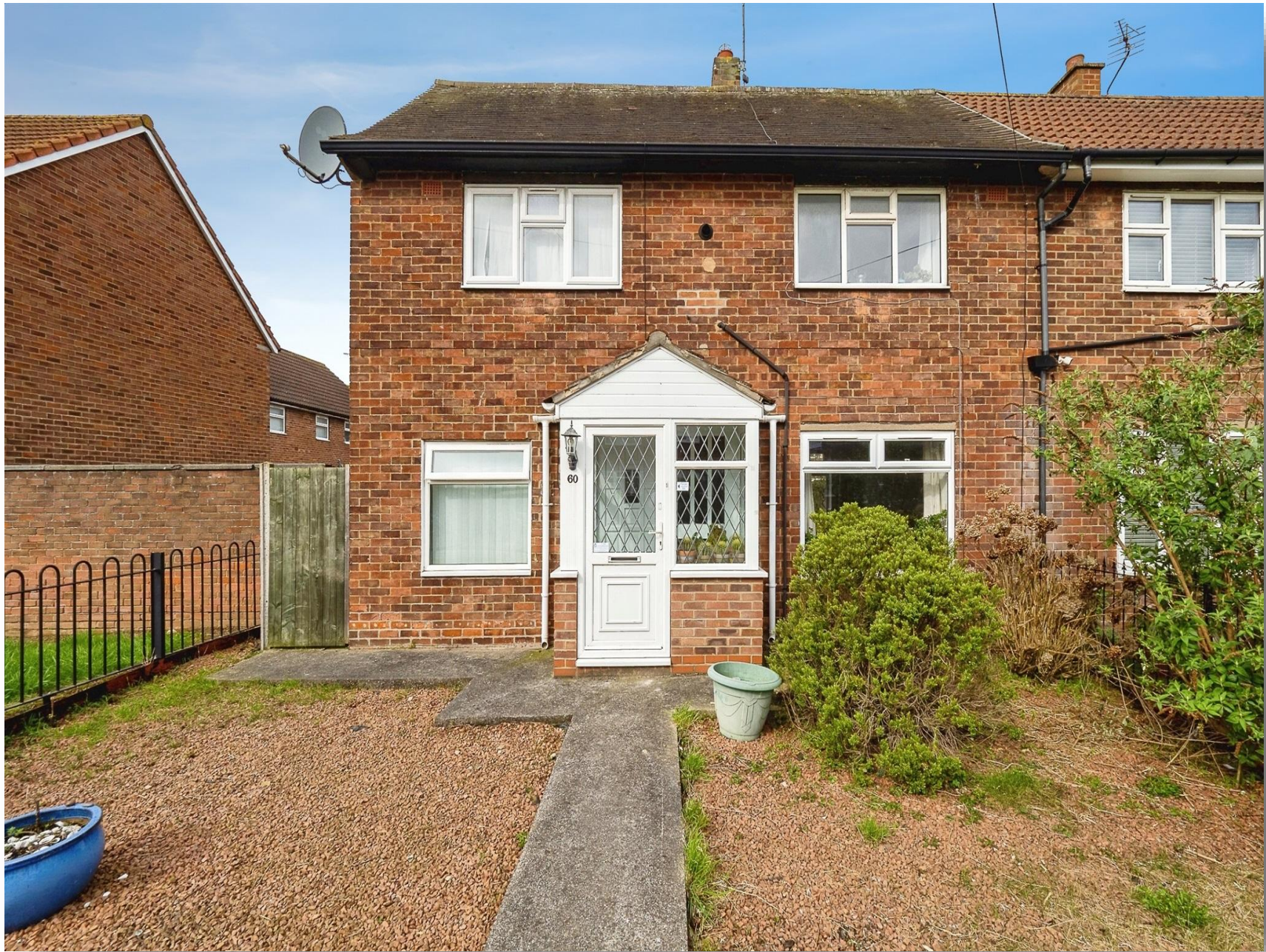
Hermes Close, Hull, HU9 4DP