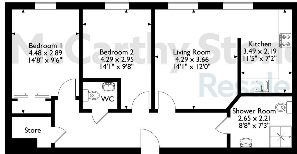
The position & size of doors, windows, appliances and other features are approximate only. © ehouse. Unauthorised reproduction prohibited. Drawing ref. dig/8671546/DST.