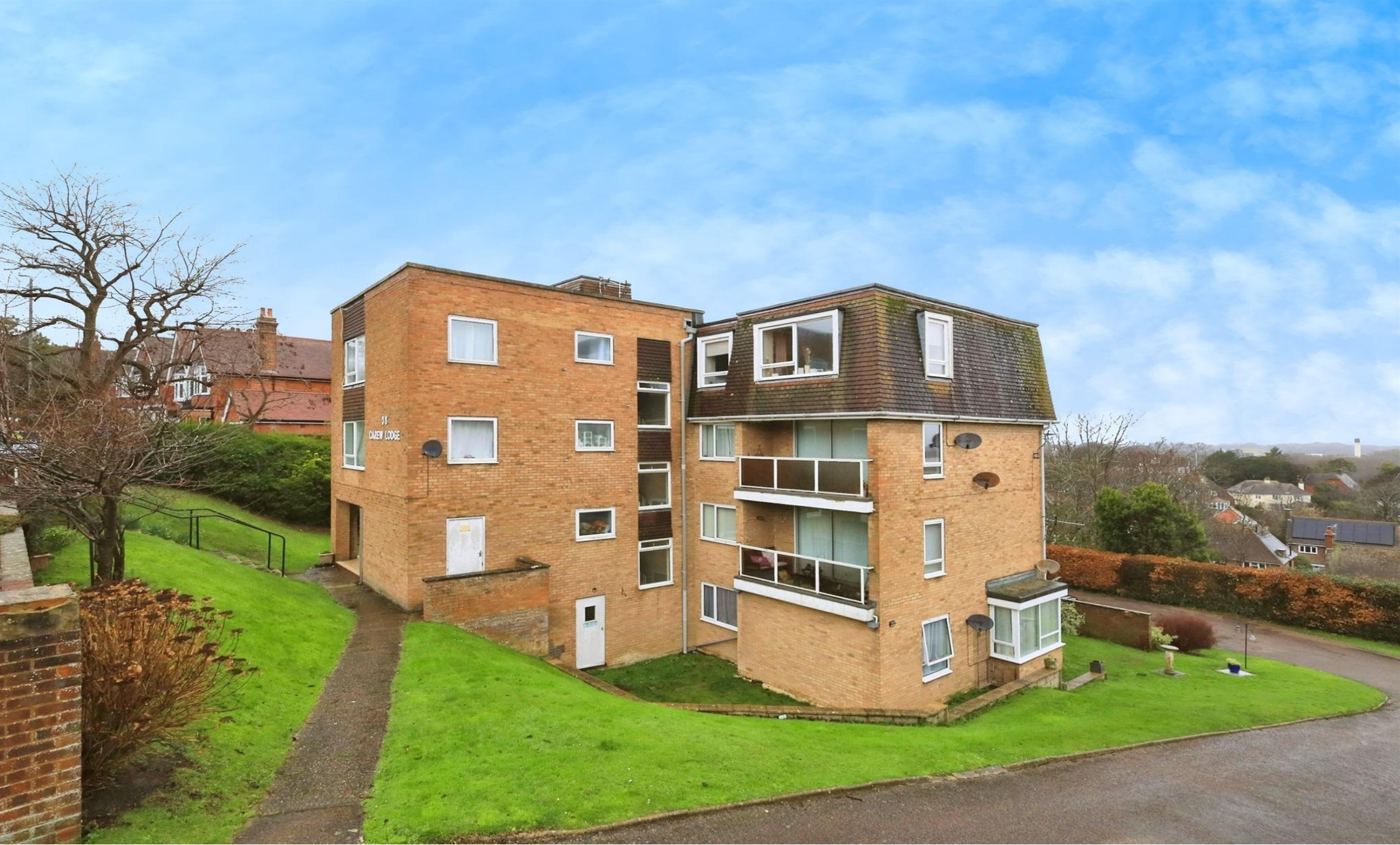
Carew Lodge Carew Road, Eastbourne BN21 2JG