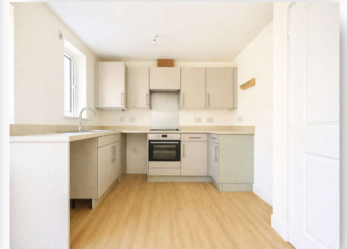
Eastside Quarter Maelfa, Llanedeyrn Cardiff CF23 9PN