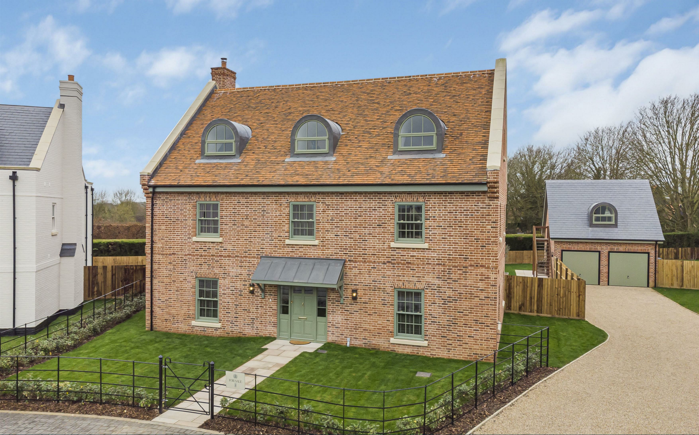
Roxborough House, The Grange, Finchingfield, CM7 4FT