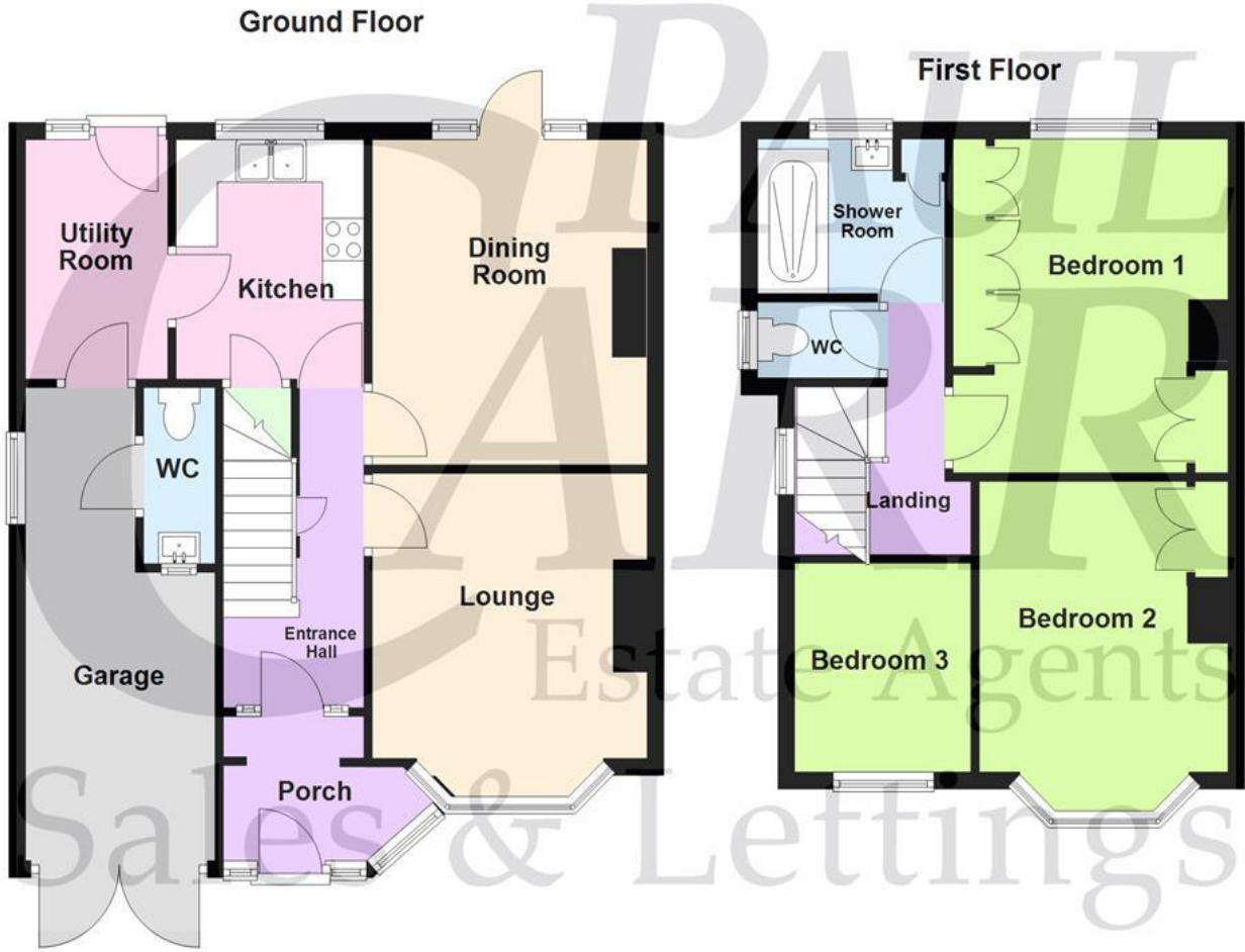
This floorplan is not drawn to scale and is for illustration purposes only Plan produced using PlanUp.

This floor plan is not drawn to scale and is for illustration purposes only