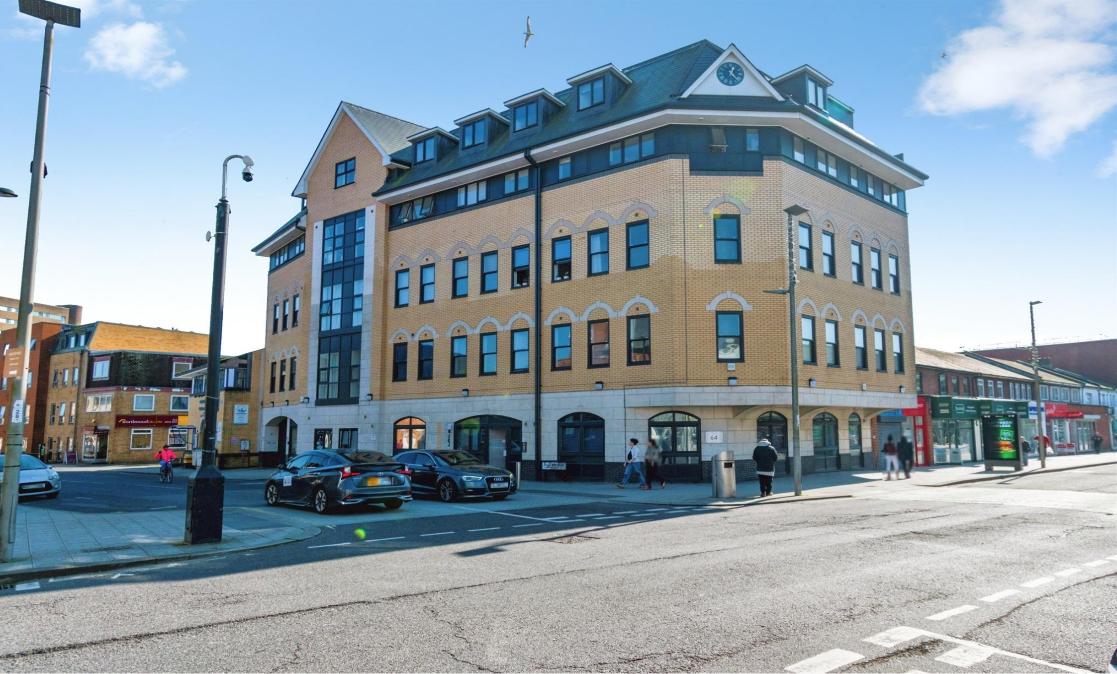
City View Apartments, London Road, Southampton SO15 2PJ