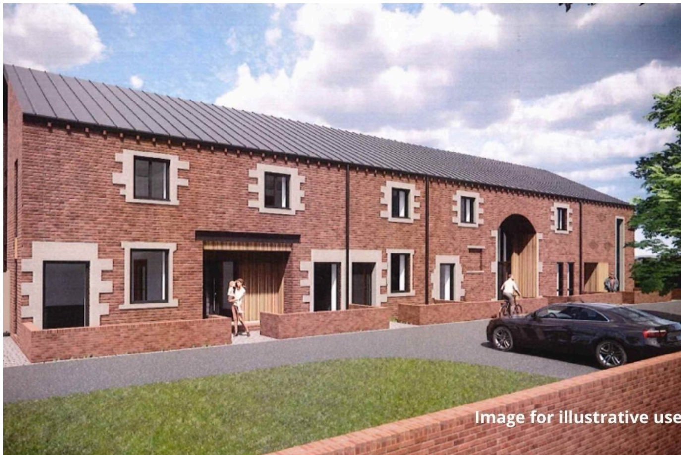
Image for illustrative use