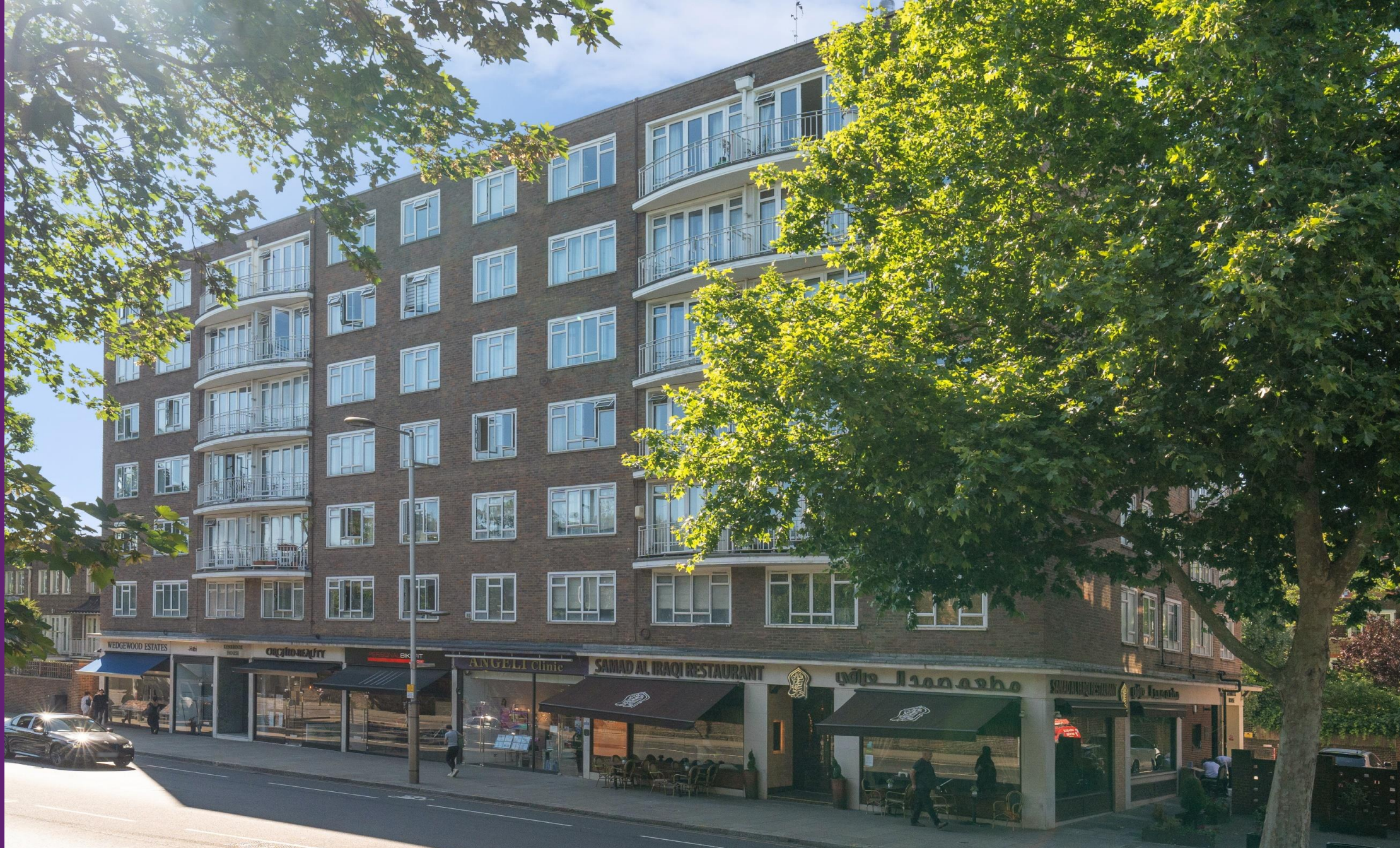
Kenbrook House Kensington High Street, W14