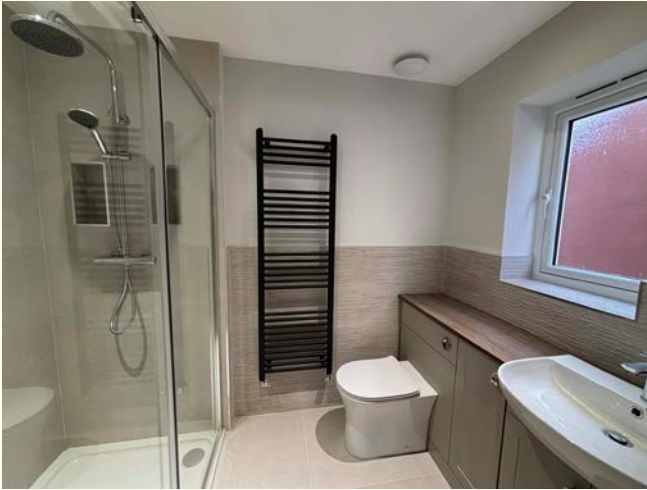
Bedroom 1 En-Suite