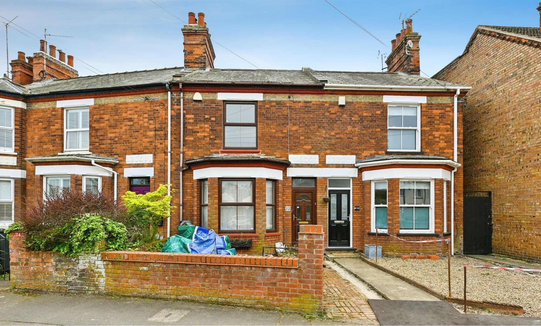
Avenue Road, King's Lynn, PE30 5NW