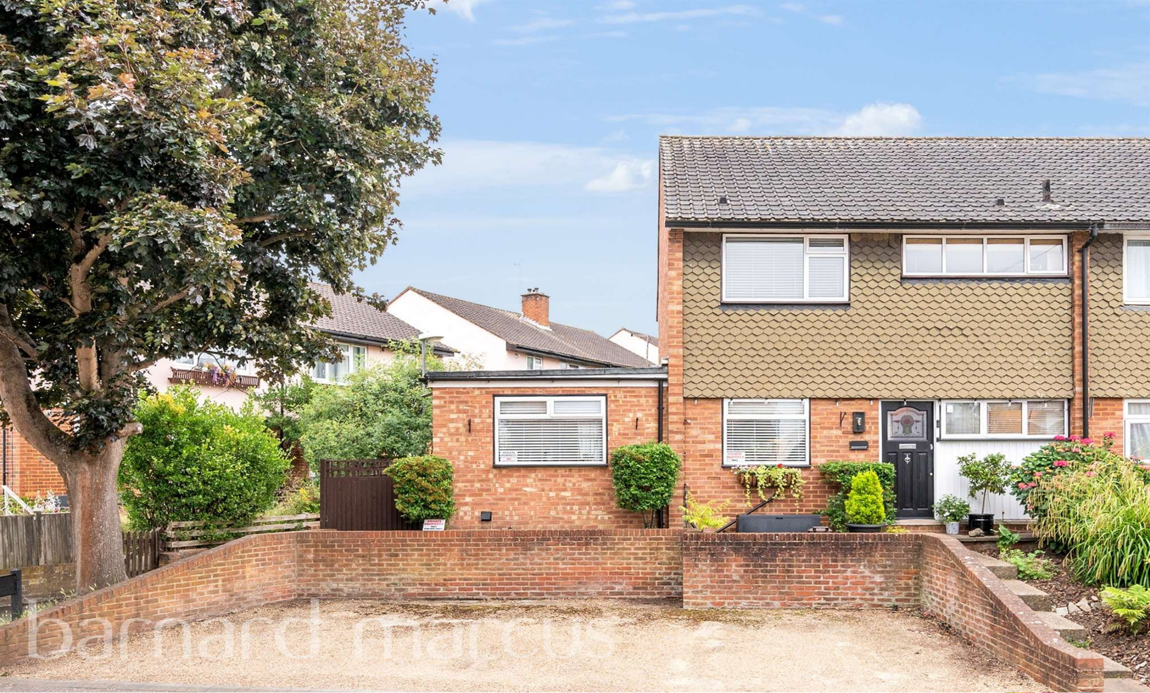
Garrison Lane, Chessington KT9 2LD