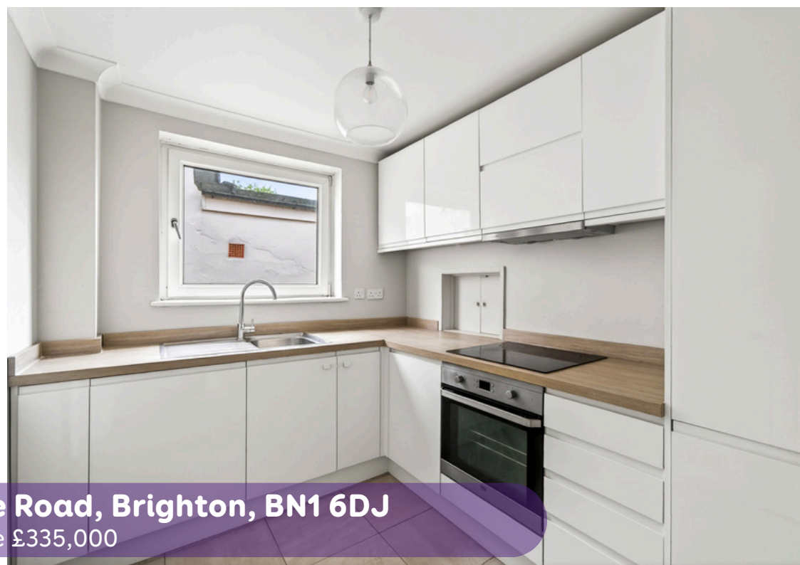
Calmvale House, Florence Road, Brighton, BN1 6DJ Asking Price £335,000