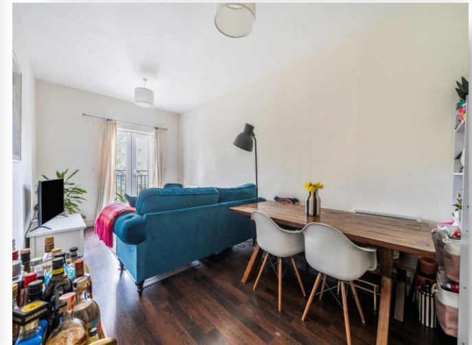
Flat 32 Park View, Grenfell Road, Maidenhead SL6 1FG