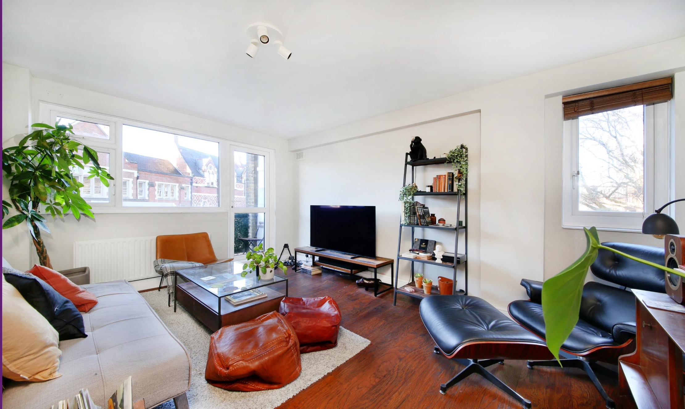
Lindsay Court Battersea High Street, SW11