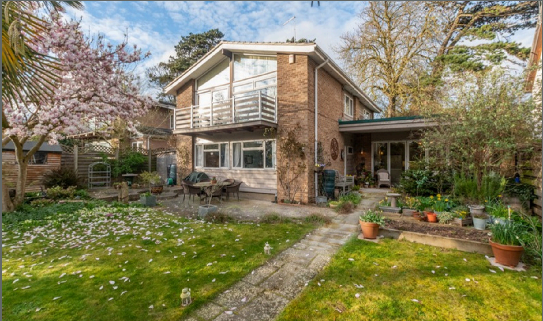
8 Fox Dale Stamford