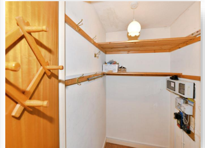
Barncott Mudge Way, Plymouth PL7 2PS