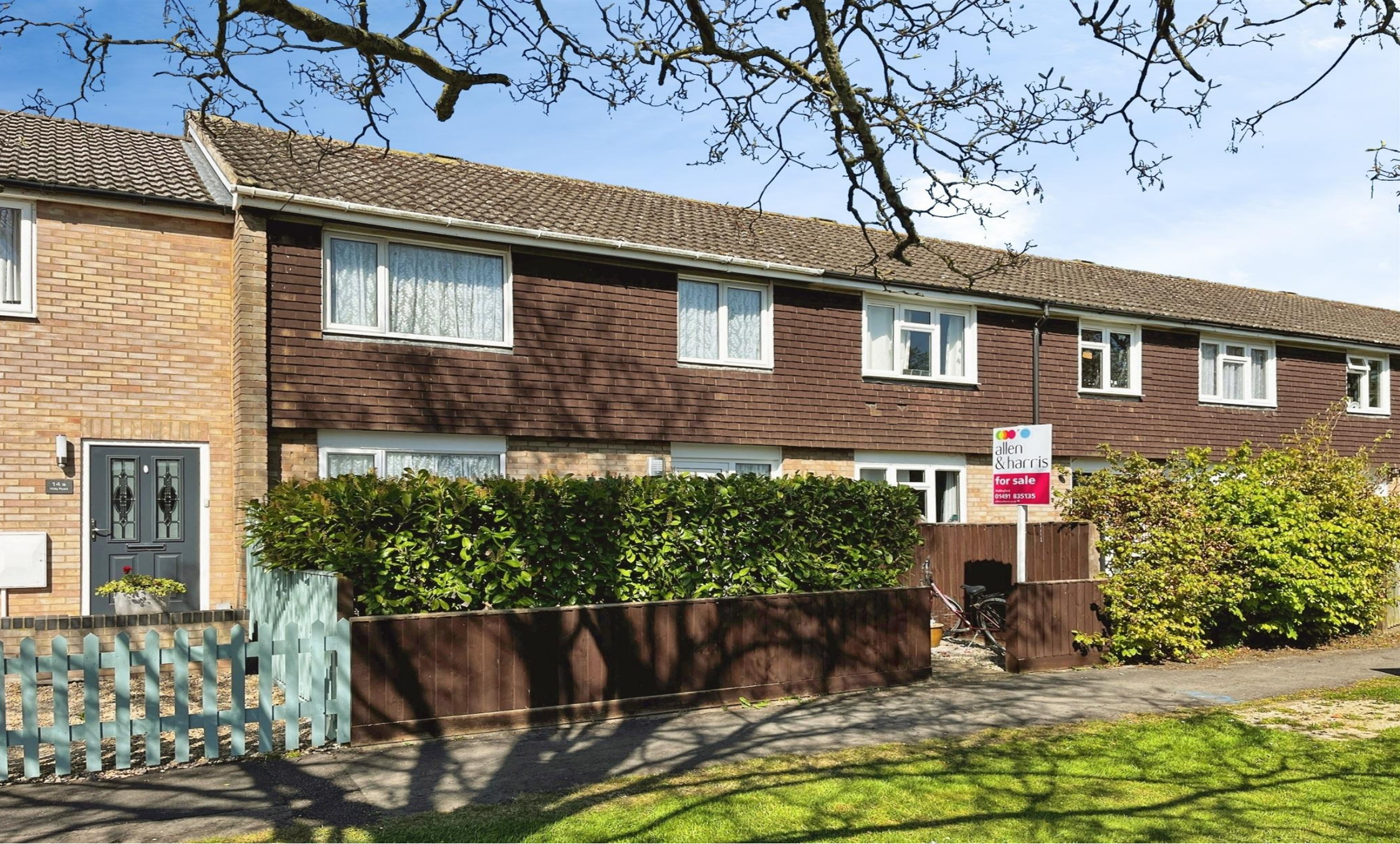
Wey Road, Berinsfield, Wallingford OX10 7PS