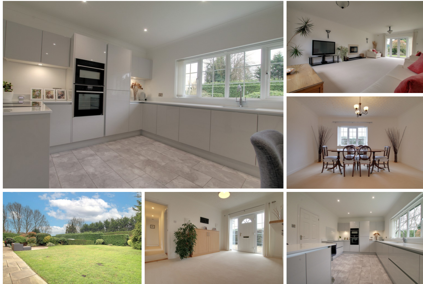
Ground Floor Approx. 168.4 sq. metres (1812.3 sq. feet)

St Mary's Road, Ramsey St Mary's, Huntingdon PE26 2SN