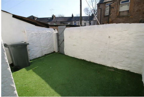
Astro turf patio area, gate to access road.