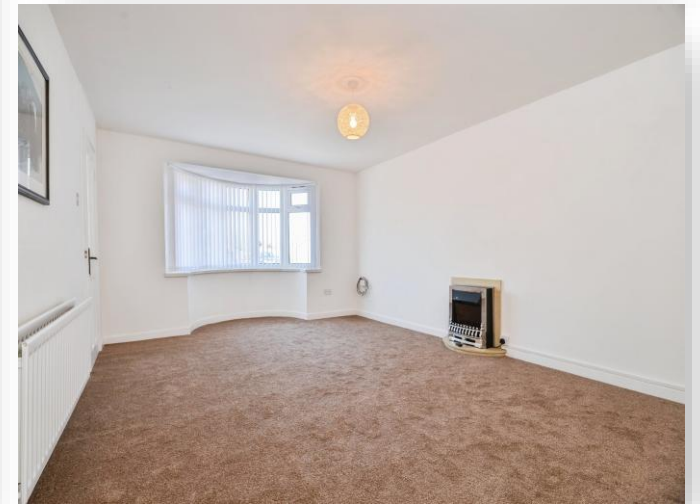
Tollerton Close, Stockton-On-Tees TS19 0QX