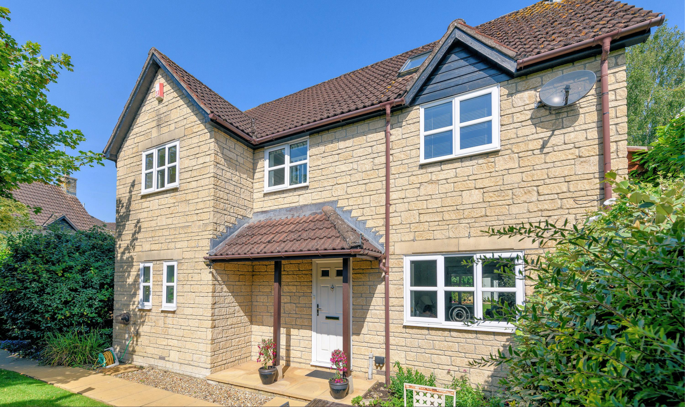
4 Sand Close Bradford on Avon, Wiltshire, BA15 1BJ