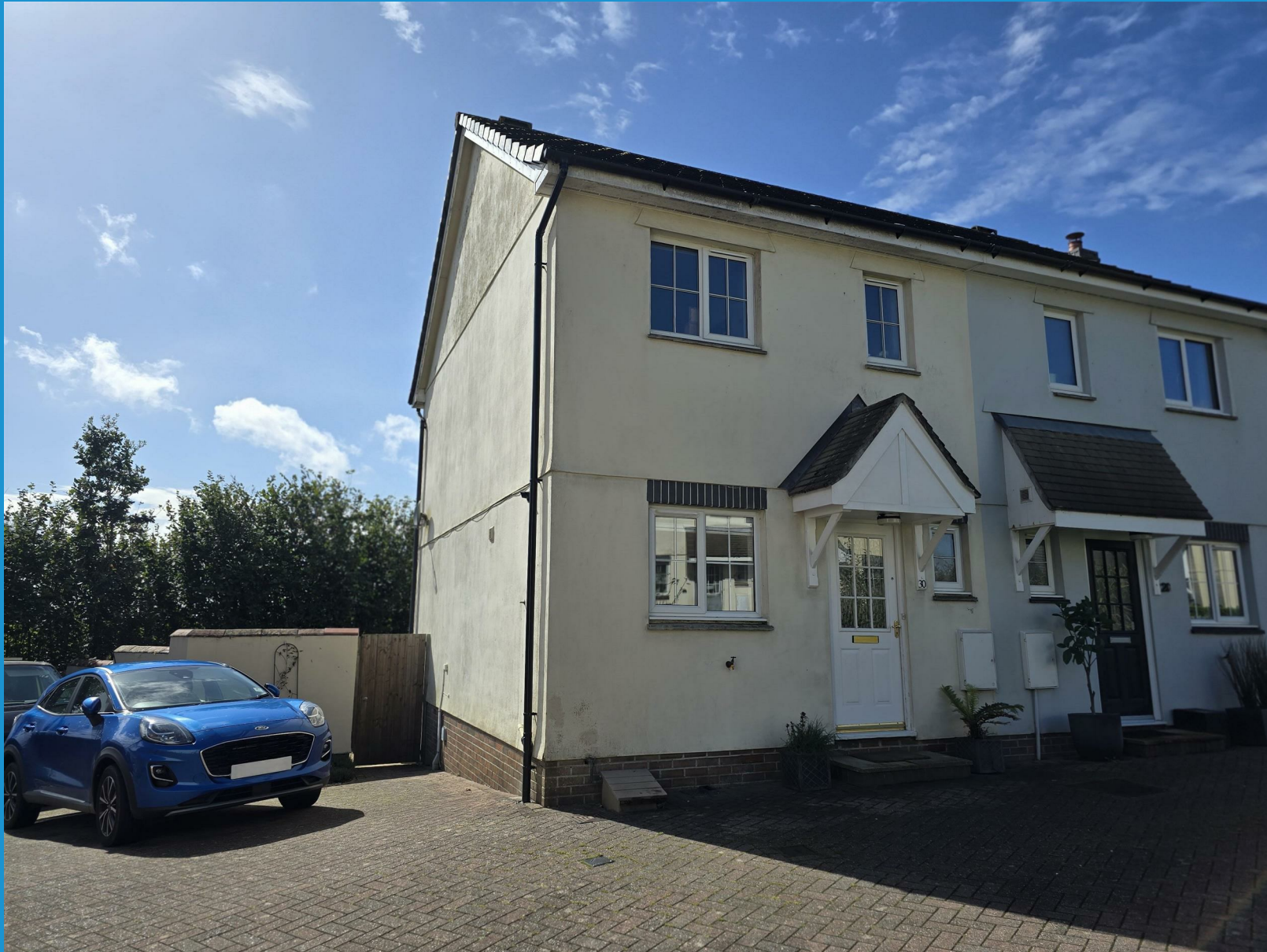
Robin Drive Launceston | Cornwall