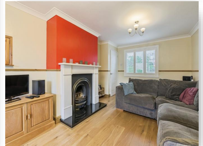
Erle Gardens, Plympton PL7 1NZ