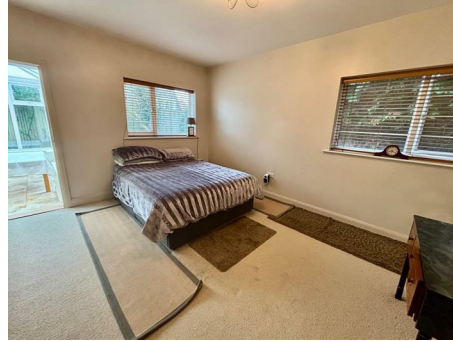
Bedroom One / Guest's Quarters 14'2" x 11'7" (4.32 x 3.54)

Having radiator and UPVC double glazed windows to both rear and side aspects. An internal door leads to the:-