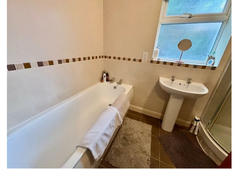
Bathroom En-Suite 8'8" x 5'9" (2.66 x 1.77)

Having a white four piece suite comprising; low centre flush wc, pedestal wash hand basin, panelled bath and quadrant tiled shower cubicle with mains fed shower, complimentary ceramic tiled walls with contrasting ceramic tiled floor, chrome heated towel rail and UPVC opaque double glazed window to rear aspect.