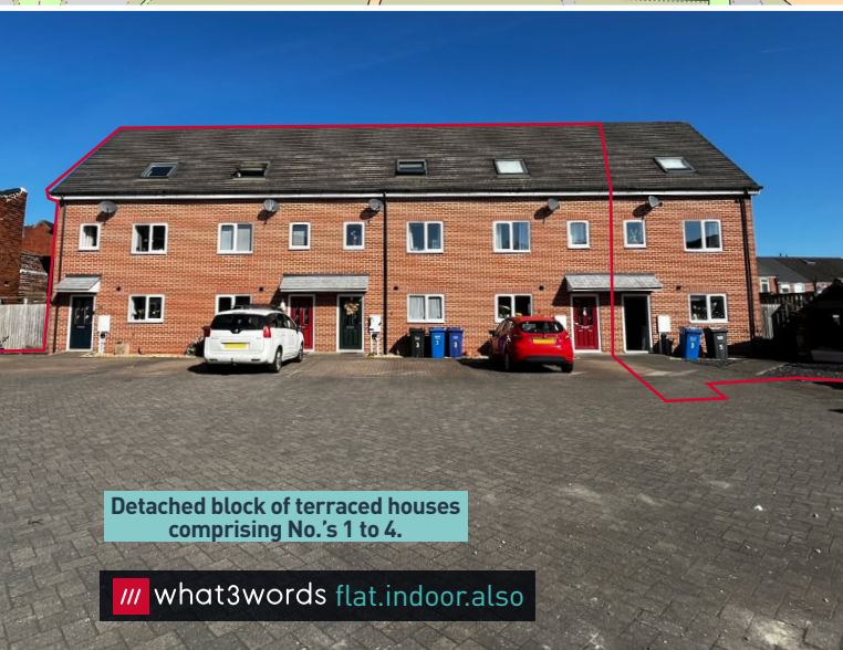
Detached block of terraced houses comprising No.'s 1 to 4.

Price on Application for the Freehold interest.