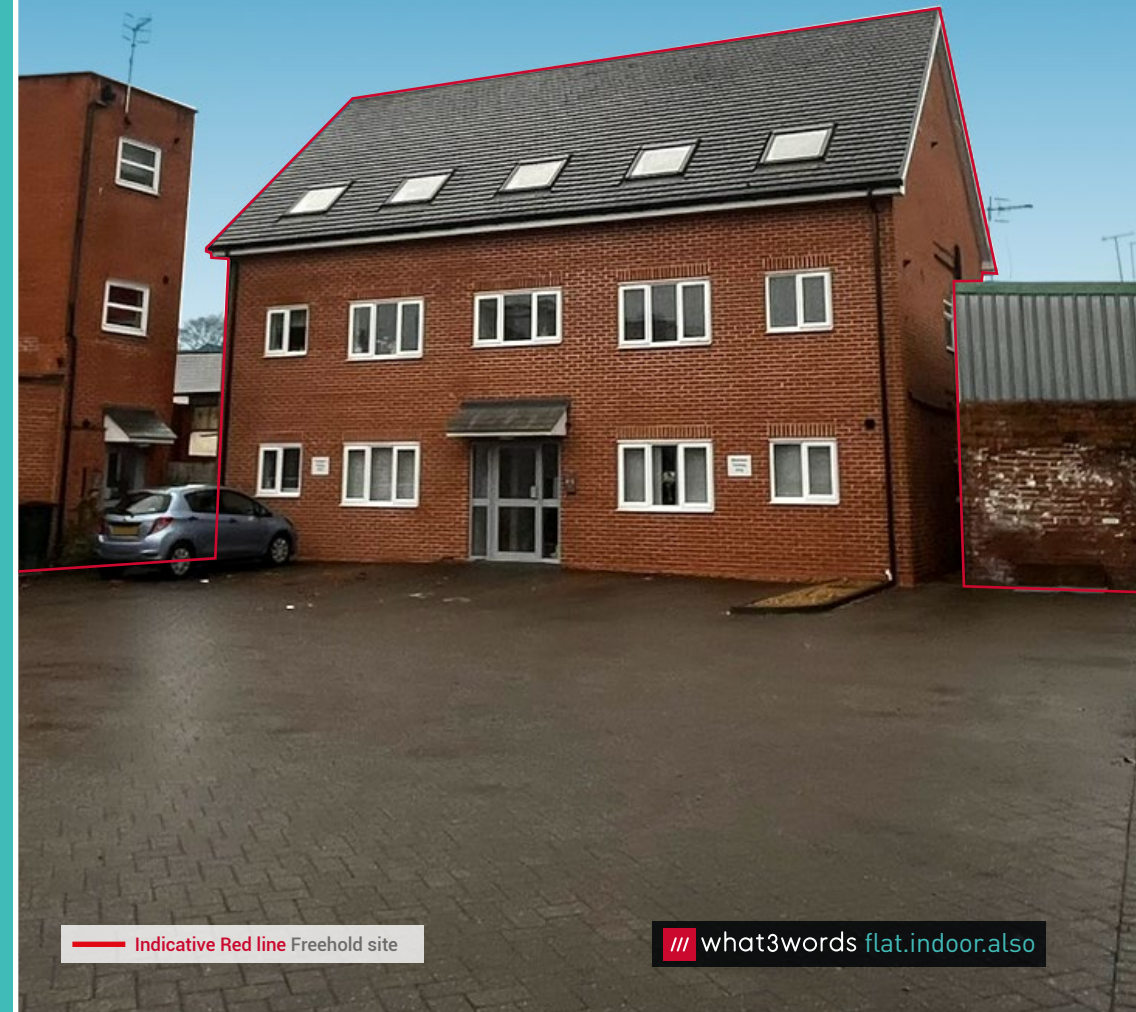
Indicative Red line Freehold site