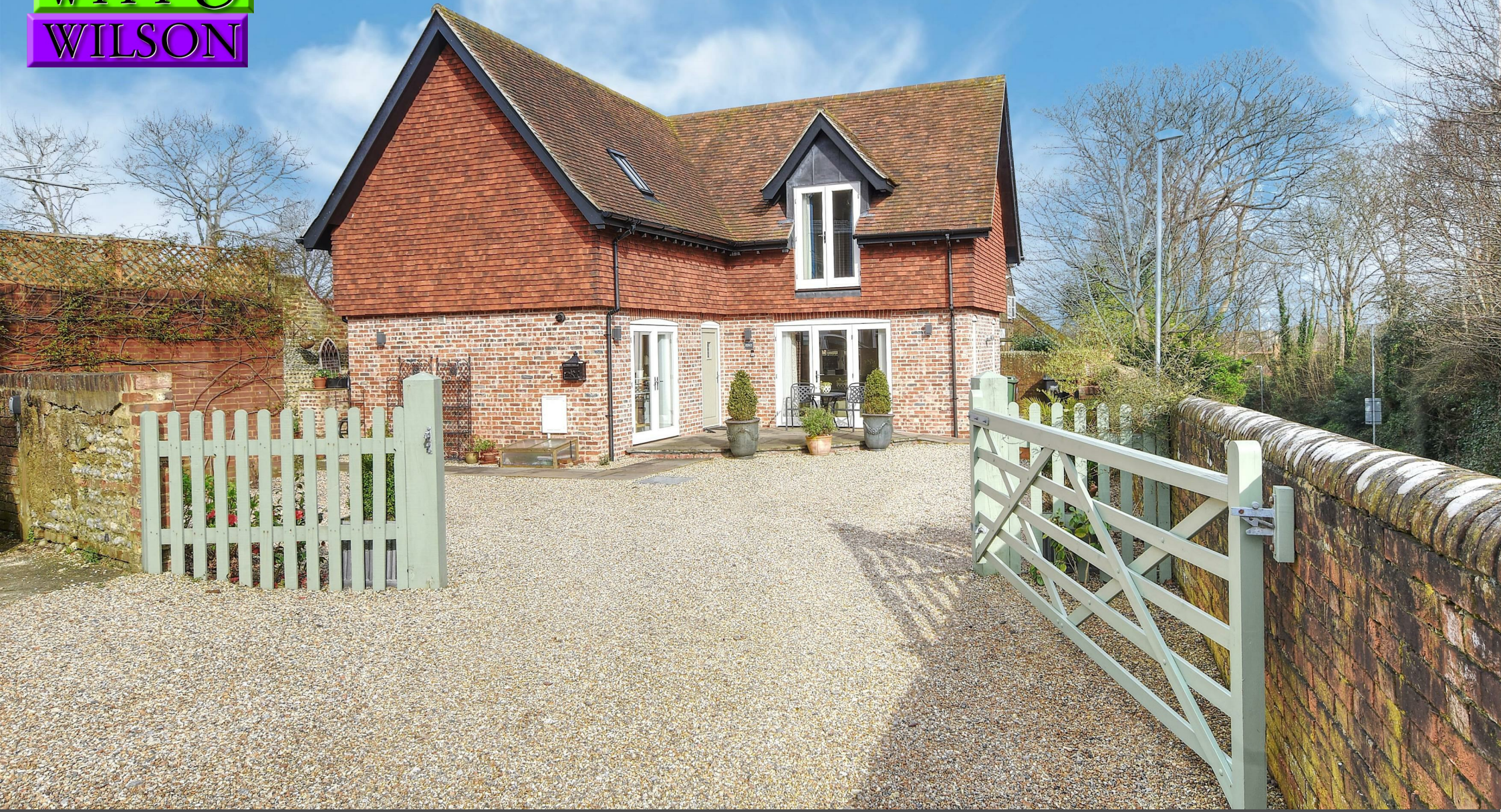
Barrack Hall Coach House Belle Hill, Bexhill-On-Sea, East Sussex TN40 2AP £625,000 Freehold