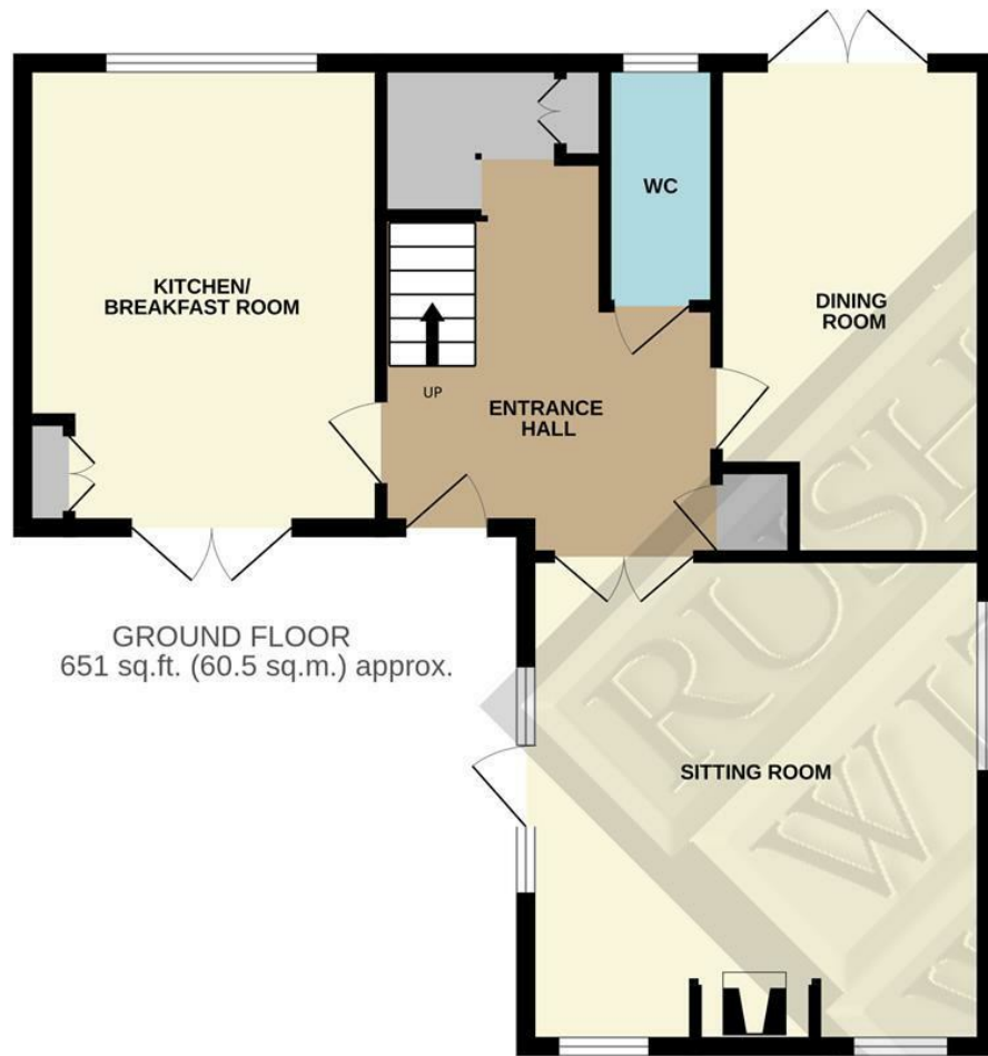
GROUND FLOOR 651 sq.ft. (60.5 sq.m.) approx.