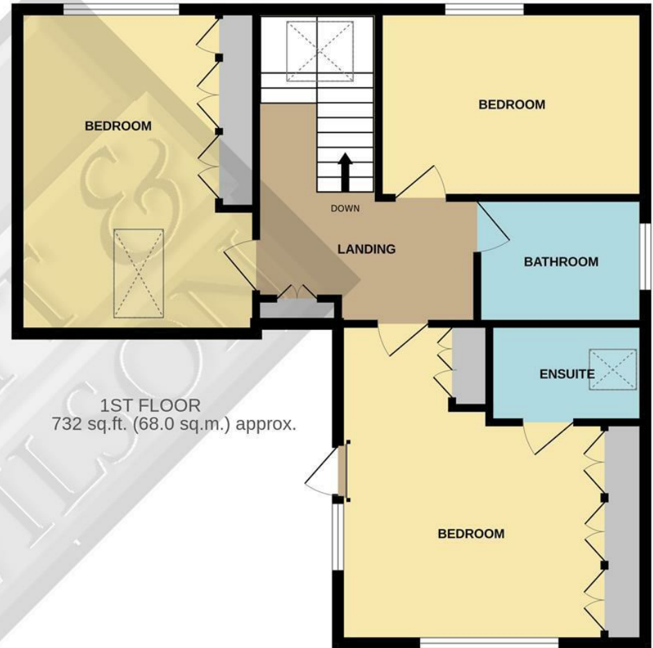
1ST FLOOR 732 sq.ft. (68.0 sq.m.) approx.

TOTAL FLOOR AREA : 1383 sq.ft. (128.5 sq.m.) approx.