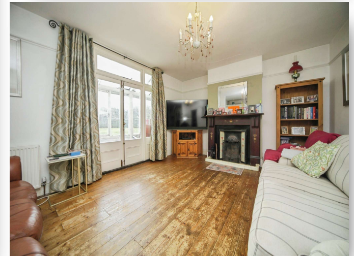
Finborough Road, Stowmarket, IP14 1PS