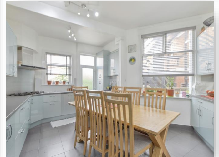
St. Peters Road, Leicester LE2 1DE