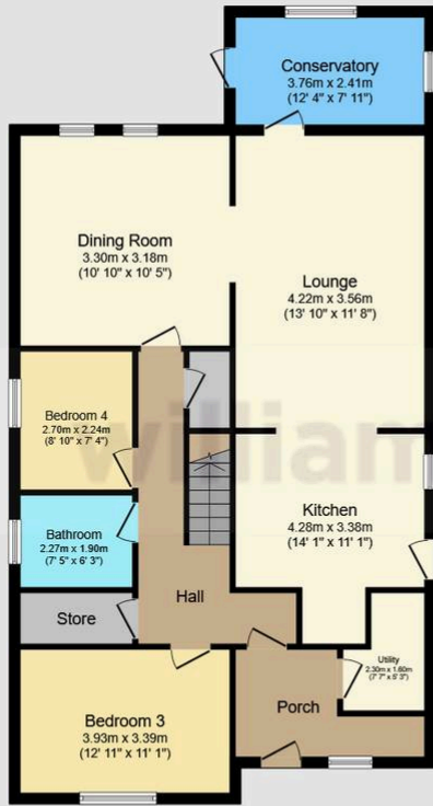
Ground Floor Floor area 106.9 sq.m. (1,151 sq.ft.)