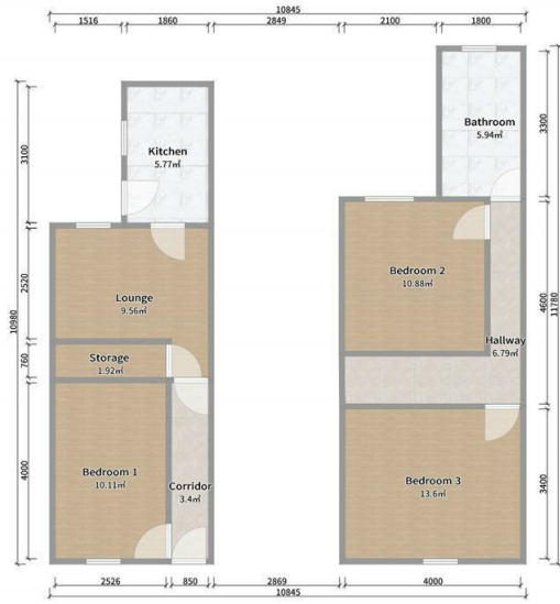
Milner Road Ground First Floor