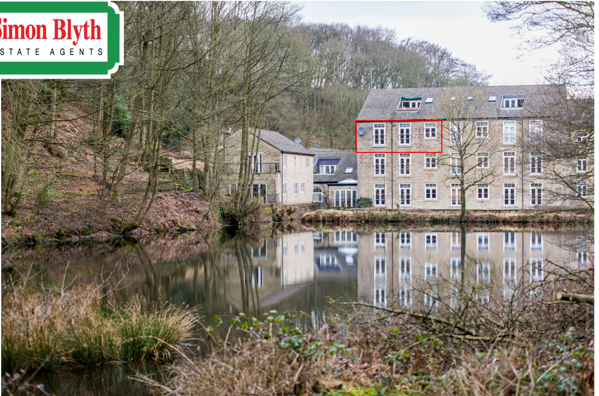
WILDSPUR MILLS, NEW MILL, HOLMFIRTH, HD9 7BA