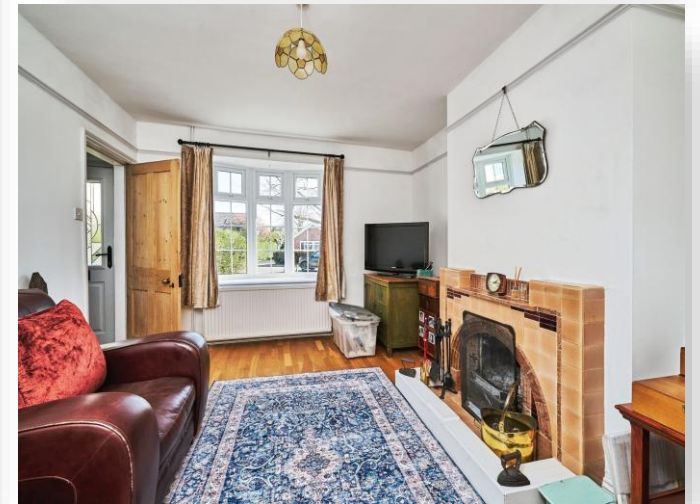
Middletons Road, Yaxley Peterborough PE7 3LR