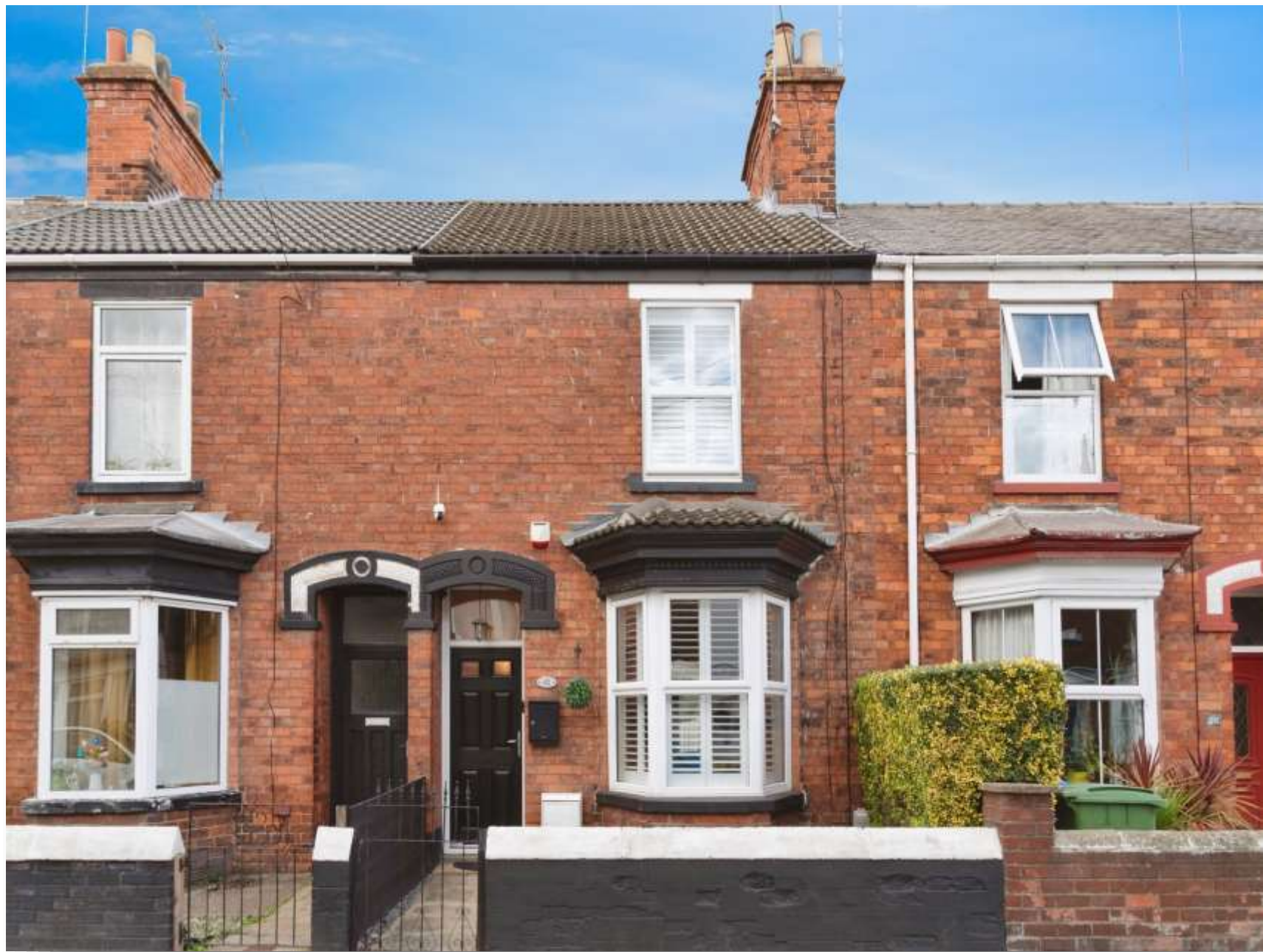
Grovehill Road, BEVERLEY, HU17 0EA