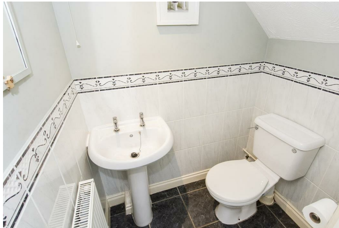
Ground Floor WC

Low level WC. Wash hand basin. Complementary half tiling. Radiator. Extractor fan.