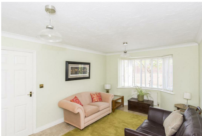
Lounge 10'9" x 15'2" (3.298 x 4.625)

UPVC Double glazed bay window to front. Two radiators. Tiled flooring. Tv point. Telephone point.