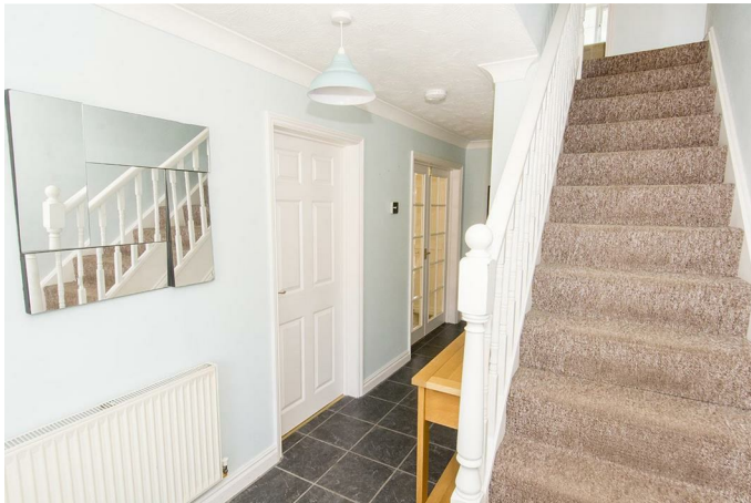
Entrance Hall 17'8" x 7'1" (5.41 x 2.166)

Accessed via double-glazed UPVC front door. Stairs rising to the first floor. Doors to all rooms. Tiled flooring throughout. Hive heating control. Radiator. Doorway to:-