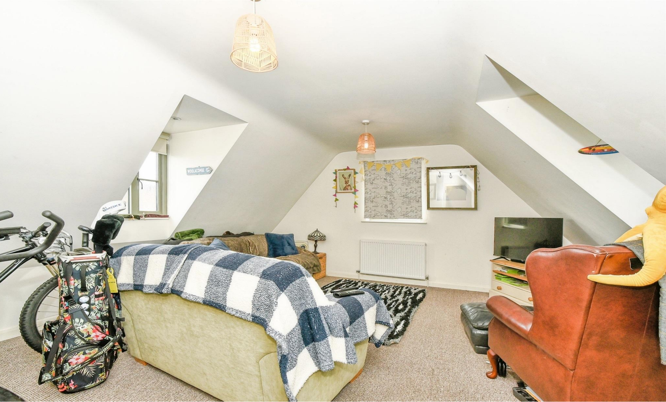
The Pippin, Calne SN11 8JQ