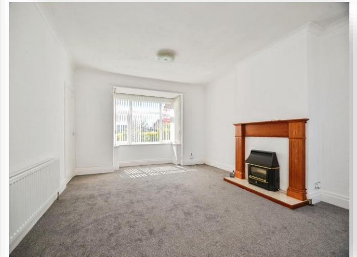
Millbank Lane, Thornaby Stockton-On-Tees TS17 8JT