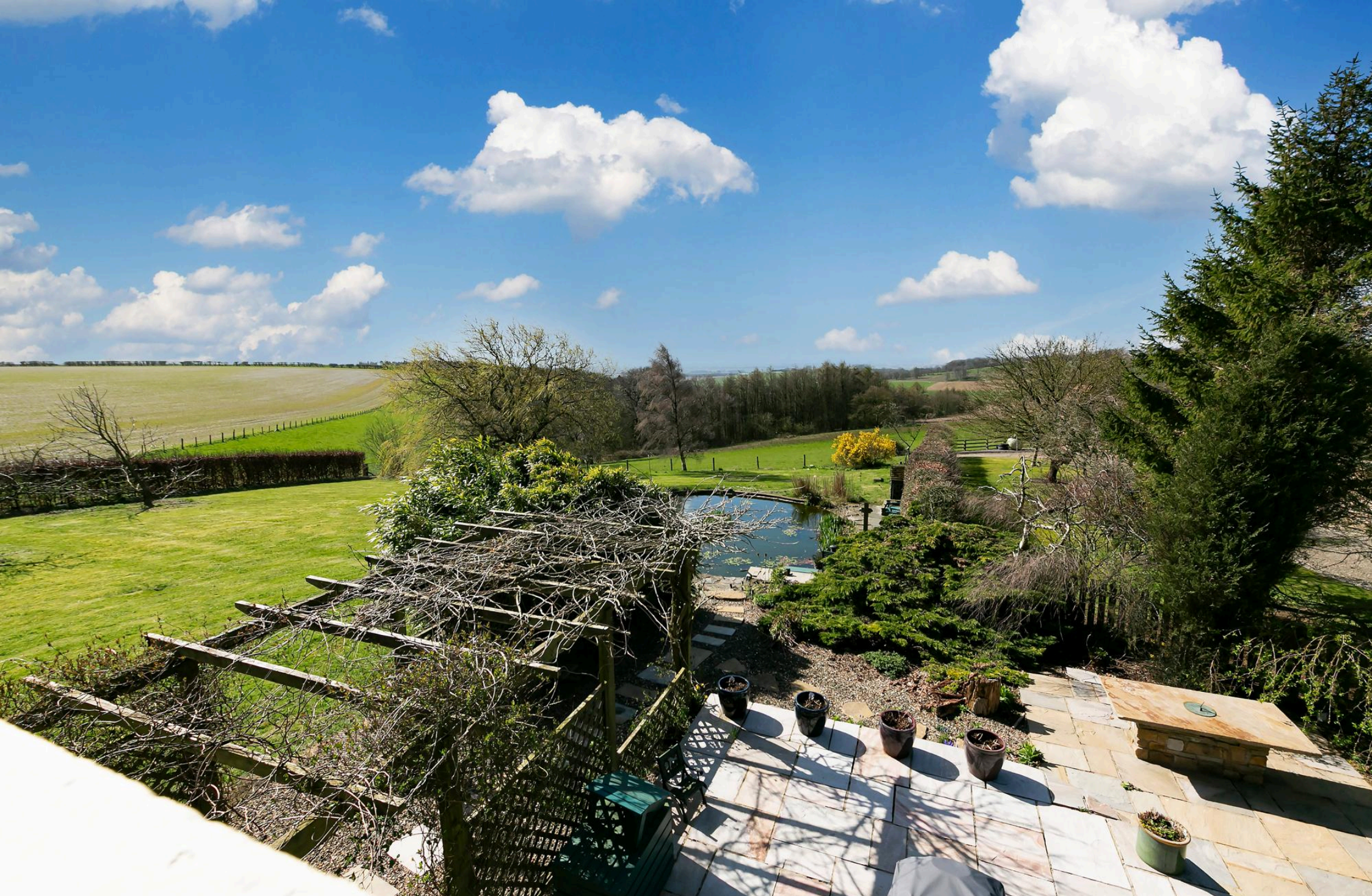
A TRULY SPECIAL FAMILY HOME WITH STUNNING VIEWS, OUTBUILDINGS & 2 ACRES